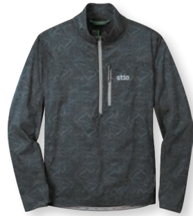
M's Second Light Pullover