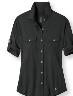
W's Divide Shirt