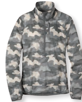
W's Second Light Pullover