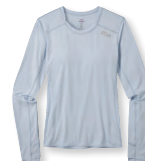
W's Hylas Crew