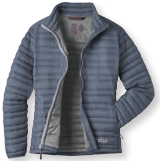
W's Pinion Down Sweater