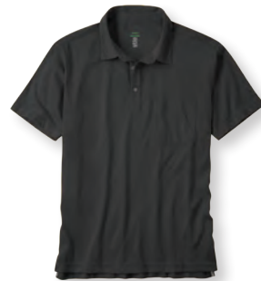
M's Divide Polo