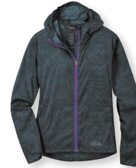
W's Second Light Windshell