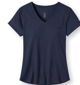
W's Divide Tee SS