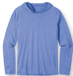
M's Divide Hooded Pullover