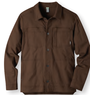
M's Ralston Canvas Jacket