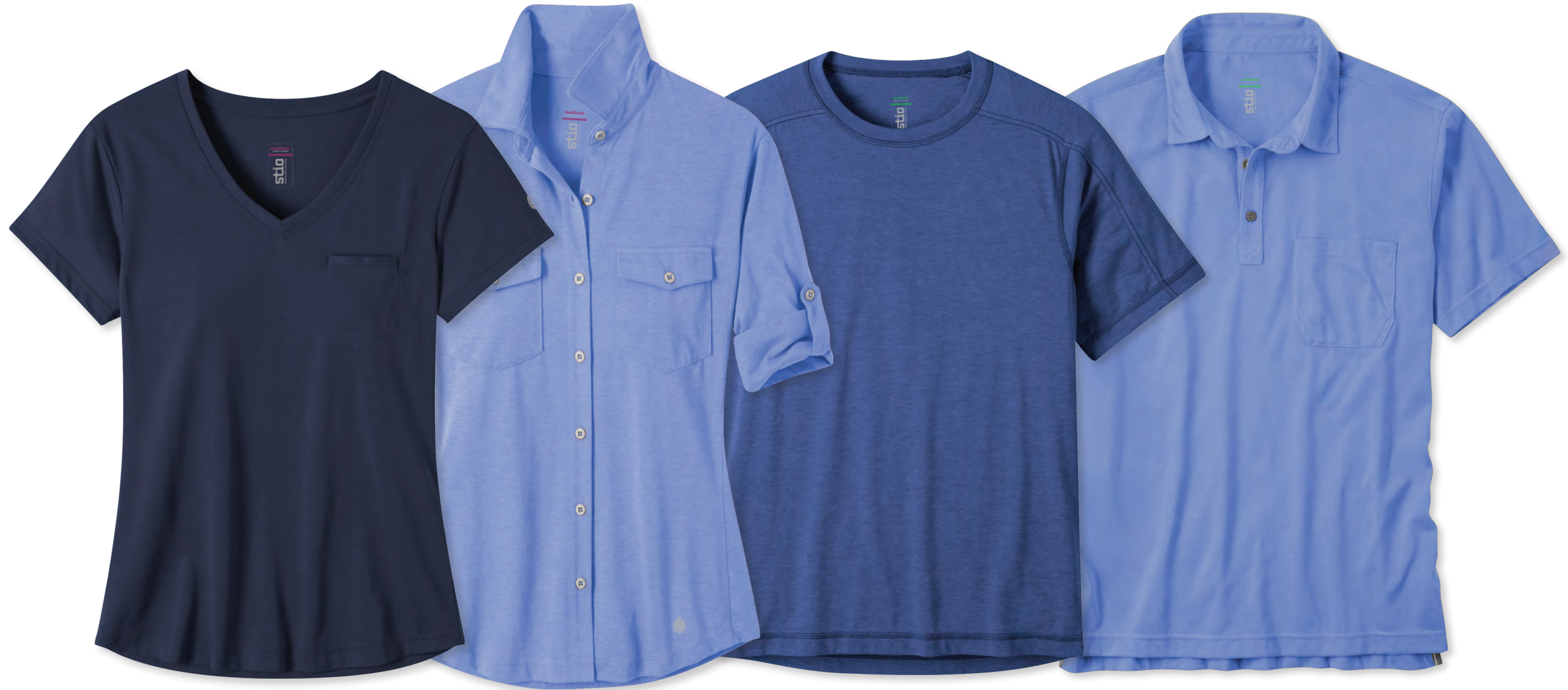
Maritime Blue Heather

Made to mix, match, divide and conquer, these everyday essentials are so much more than that. Bolstered with a technical twist to support the daily motion of life, the Divide Collection dries 4x faster than cotton, fights odor, wicks moisture and offers all-day comfort and style for every occasion.