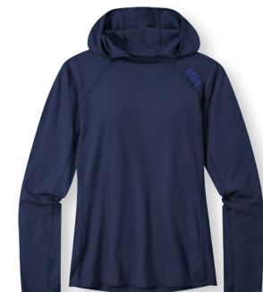
W's Hylas Pullover