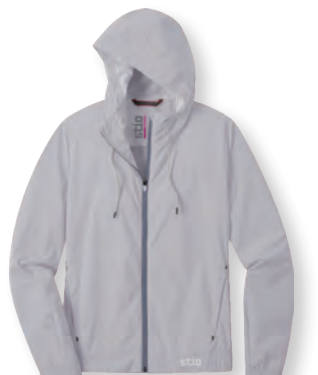
W's PTV Hooded Jacket