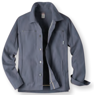
W's Ralston Canvas Jacket