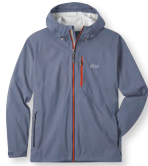
M's Modis Hooded Jacket