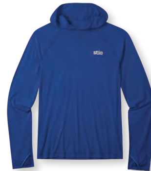
M's Hylas Pullover