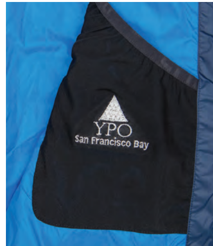
YPO Interior Pocket Embroidery