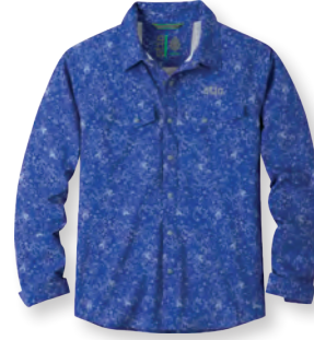
M's CFS Shirt