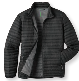
M's Pinion Down Sweater