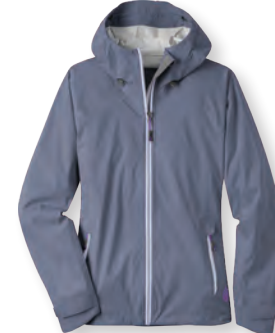
W's Modis Hooded Jacket