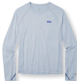
M's Hylas Crew