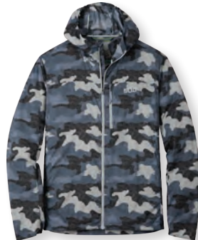
M's Second Light Windshell