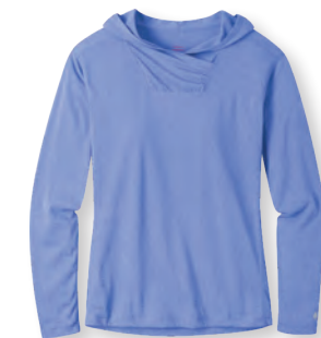
W's Divide Hooded Pullover