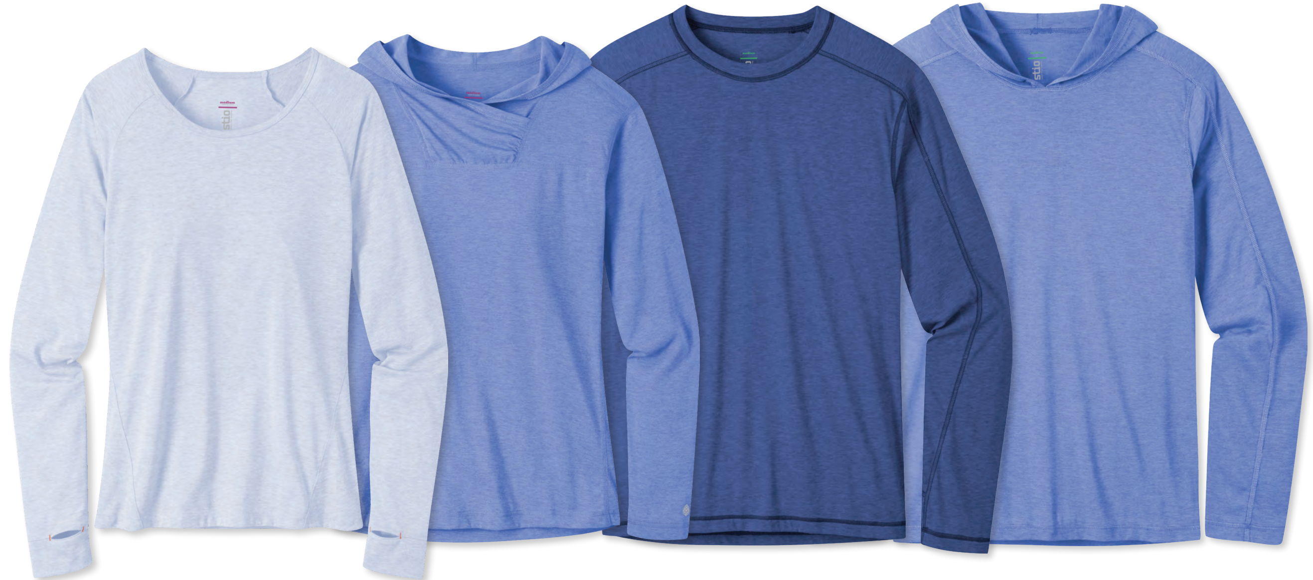
Alpine Lake Heather

Made to mix, match, divide and conquer, these everyday essentials are so much more than that. Bolstered with a technical twist to support the daily motion of life, the Divide Collection dries 4x faster than cotton, fights odor, wicks moisture and offers all-day comfort and style for every occasion.