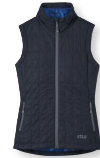
W's Azura Insulated Vest