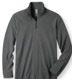
M's Turpin Fleece Half Zip