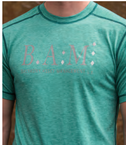
BAM Chest Embroidery

We are happy to help you get creative with logo placement if you would like anything other than the options displayed above.