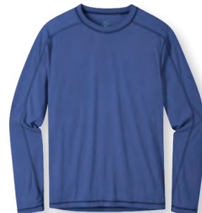
M's Divide Tee LS