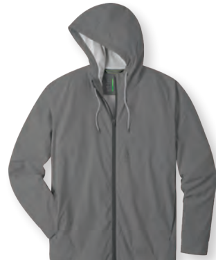
M's PTV Hooded Jacket