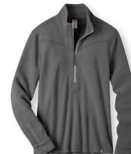
W's Turpin Fleece Half Zip