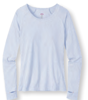
W's Divide Tee LS