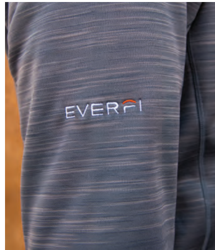
Everfi Sleeve Embroidery