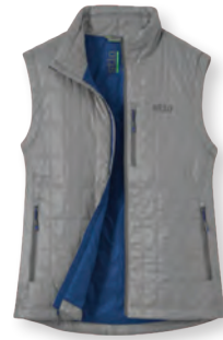
M's Azura Insulated Vest